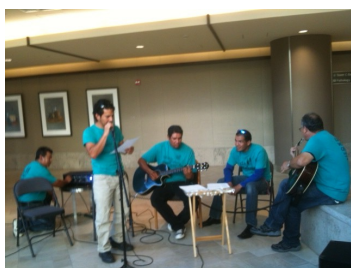
Testing sound before a performance at El Camino Hospital.

12 students have earned certificates so far. Congratulations to them, and may they keep up the hard work!