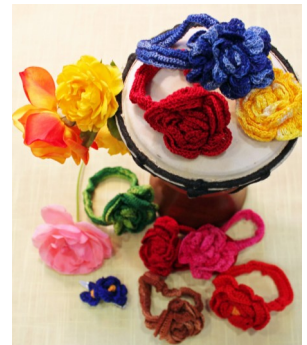
Scrunchies crocheted by Aurora.

you are interested in purchasing from the ladies. Please share with friends and family! Our hope is that this publicity boost will assist the ladies to turn their skill into an additional source of income.