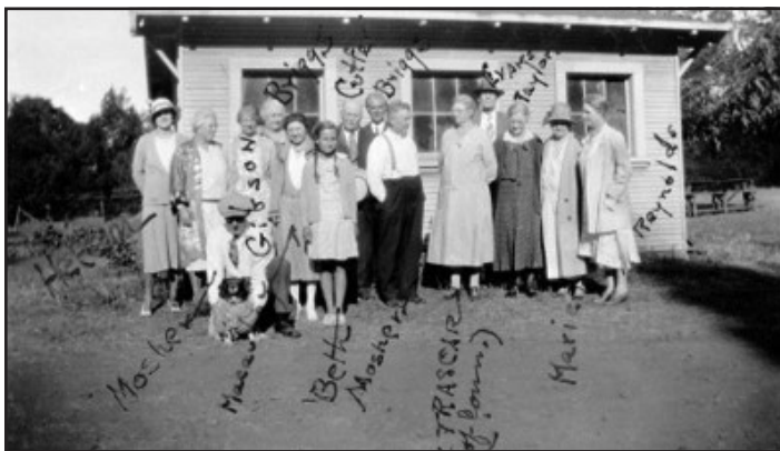
Members of the San Antonio Club in 1931, ninety years ago!

The land for the club is located on what is now called San Antonio Road, formerly Griffen or Giffin Road, and earlier